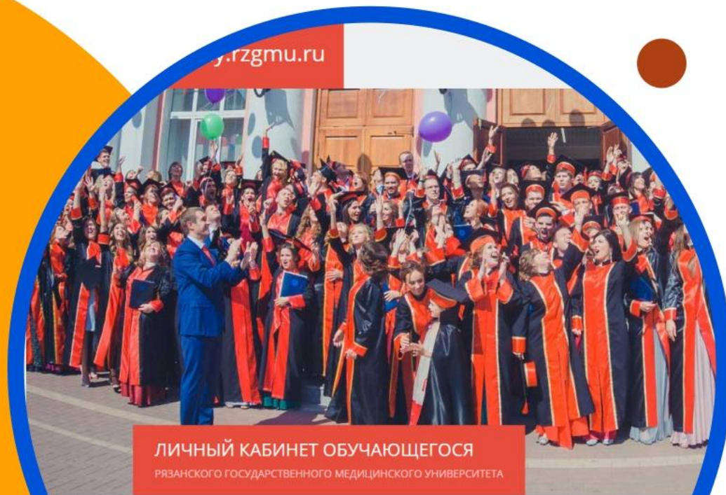
ЛИЧНЫЙ КАБИНЕТ ОБУЧАЮЩЕГОСЯ РЯЗАНСКОГО ГОСУДАРСТВЕННОГО МЕДИЦИНСКОГО УНИВЕРСИТЕТА